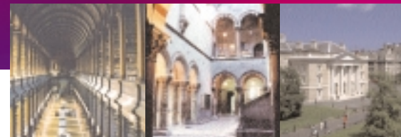
Trinity College, Dublin